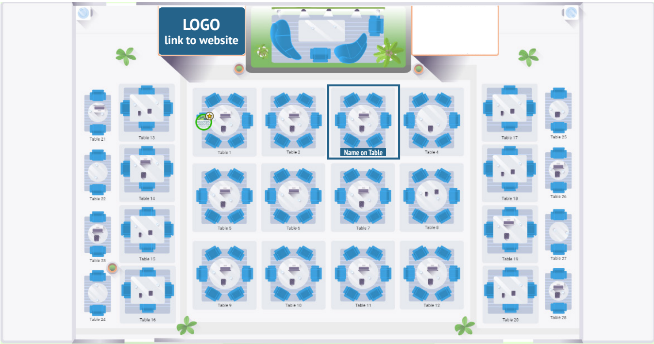
Virtual Networking Platform (REMO)